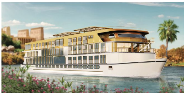
AmaLilia (artist rendering)