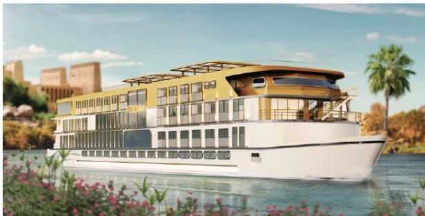
AmaLilia (artist rendering)